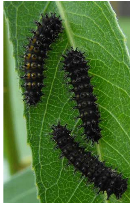
Figure 4. First instar larvae of the cecropia moth, Hyalophora cecropia Linnaeus.

The large and mottled reddish/brown eggs are laid by the female on both sides of the host leaf in small groups.