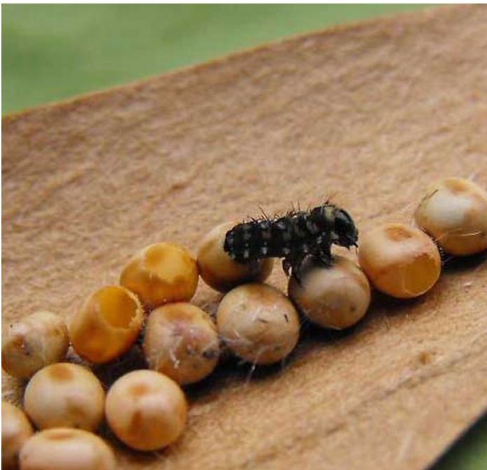
Figure 3. First instar larva of the cecropia moth, Hyalophora cecropia Linnaeus, emerging from egg.