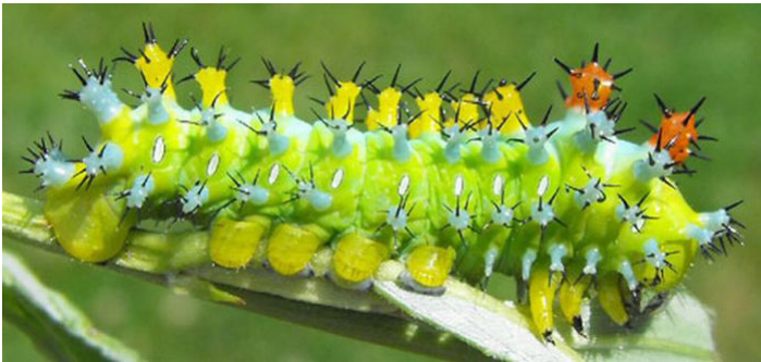
Figure 7. Fourth instar larva of the cecropia moth, Hyalophora cecropia Linnaeus.