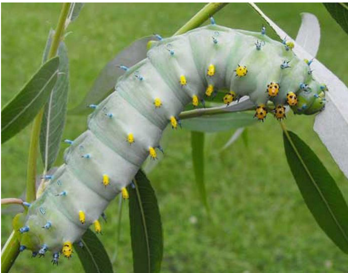
Figure 8. Fifth instar larva of the cecropia moth, Hyalophora cecropia Linnaeus. Although green in color, the top appears to have an iridescent pale-bluish sheen when viewed in direct light.