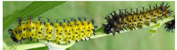
Figure 5. Second instar larvae of the cecropia moth, Hyalophora cecropia Linnaeus. Note color variation, even though they are from the same batch of eggs.