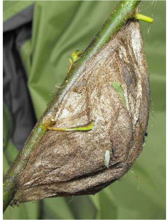
Figure 9. Cocoon of the cecropia moth, Hyalophora cecropia Linnaeus, on host plant.

protuberances, and side protuberances which are more white than blue with black bases.