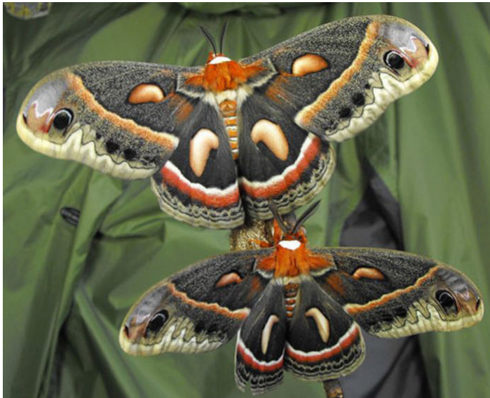
Figure 12. Adult cecropia moths, Hyalophora cecropia Linnaeus.

wings. The body is hairy, with reddish coloring anteriorly, and fading to reddish/whitish. The abdomen has alternating bands of red and white.