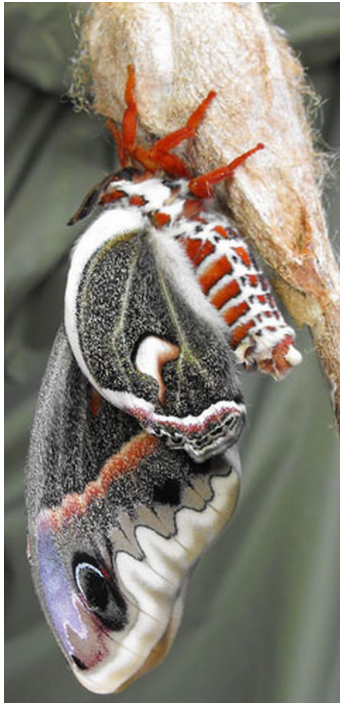
Figure 11. Newly emerged adult cecropia moth, Hyalophora cecropia Linnaeus.