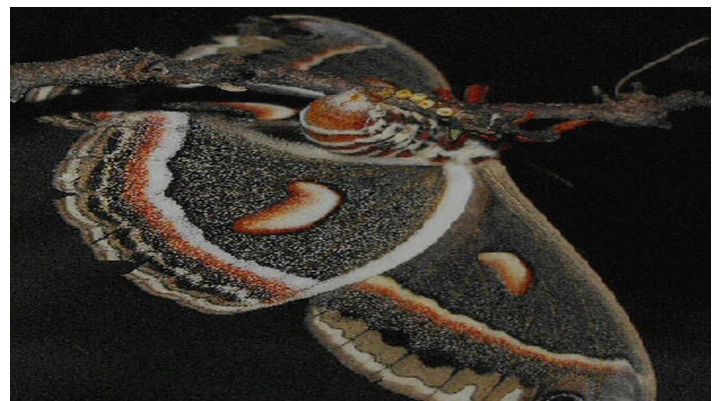
Figure 1. Adult female cecropia moth, Hyalophora cecropia Linnaeus, laying eggs on host plant.