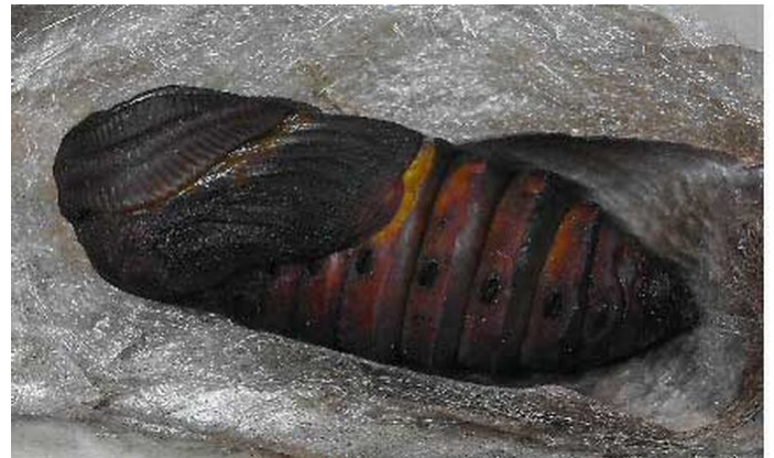
Figure 10. Pupa of the cecropia moth, Hyalophora cecropia Linnaeus, removed from cocoon.