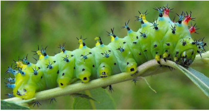
Figure 6. Third instar larva of the cecropia moth, Hyalophora cecropia Linnaeus.